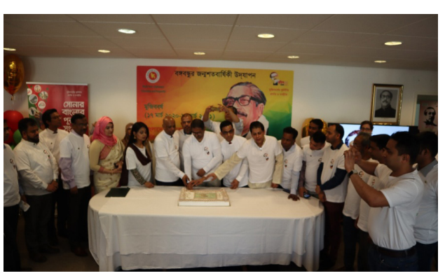
Bangladesh Embassy in Berlin