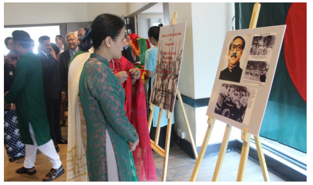
Bangladesh Embassy in Hanoi