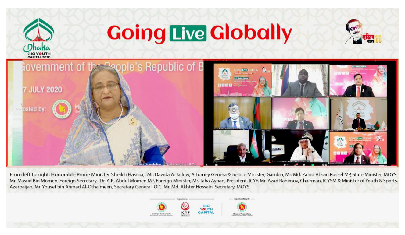
Hon'ble Prime Minister Sheikh Hasina inaugurates the Dhaka OIC Youth Capital 2020 in a virtual inauguration declaration ceremony on 27 July 2020

Dhaka OIC Youth Capital 2020 was inaugurated by Prime Minister Sheikh Hasina in a virtual inauguration declaration ceremony on 27 July 2020. It was attended by Dr. A K Abdul Momen, MP, Foreign Minister of Bangladesh; Md. Zahid Ahsan Russel, MP, State Minister for Youth and Sports of Bangladeshl; Yousef bin Ahmad Al- Othaimeen, Secretary General, Organization of Islamic Cooperation; Azad Rahimov, Minister of Youth and Sports of the Republic of Azerbaijan; Dawda A. Jallow, Justice Minister and Attorney General of the Gambia; Taha Ayhan, President, Islamic Cooperation Youth Forum (ICYF) along with other global leaders and dignitaries.