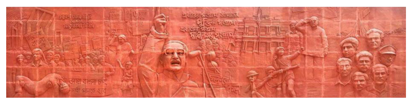
Bangladesh Deputy High Commission in Kolkata inaugurates a terracotta mural on 17 March 2020

on the life and works of Bangabandhu, recitation of poems on Bangabandhu, art competition, cultural segment, etc. A commemorative stamp on the occasion of the Birth Centenary of the Father of the Nation and the celebration of 'Mujib Year' was inaugurated in Seoul. A gallery of photographs of the event follows: