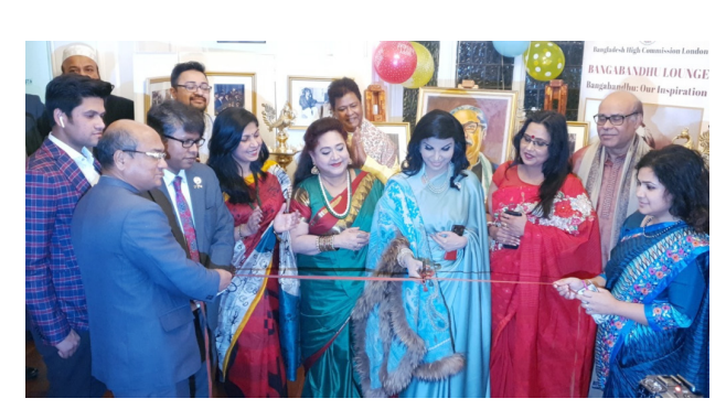
Bangladesh High Commissioner to the UK