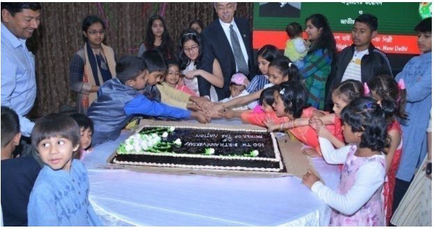
Bangladesh High Commission in New Delhi