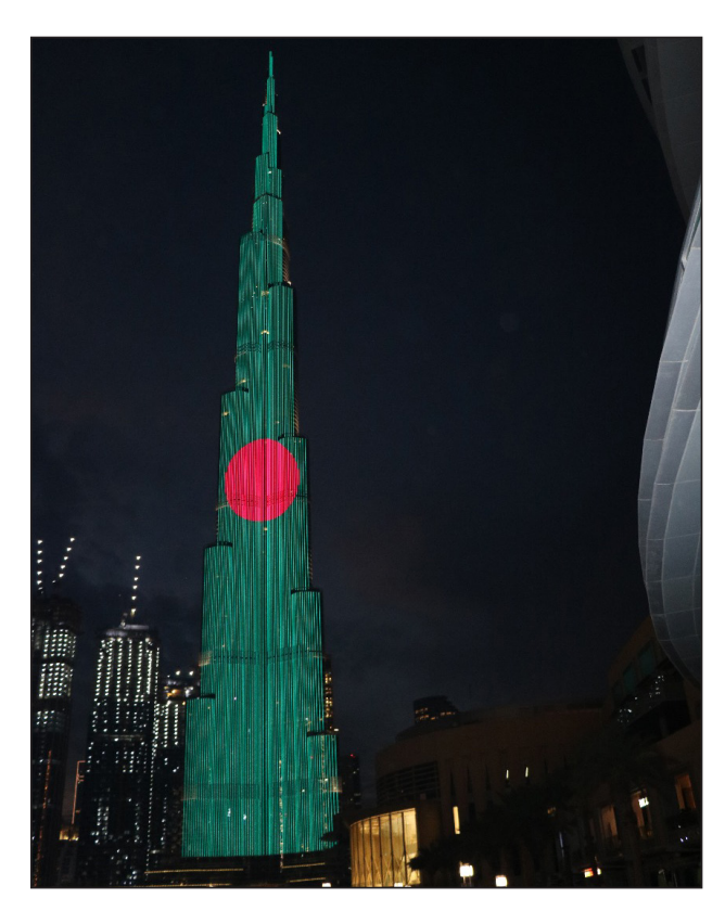
Bangladesh National Flag was displayed in the world's tallest building Burj Khalifa in Dubai on 26 March 2020 at 7:00 p.m local time on the occasion of Independence and National Day of Bangladesh