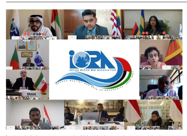
Bangladesh participates in the 10th IORA bi-annual meeting of the Committee of Senior Officials on virtual platform

He further added that through sustained dialogue and cooperation, it has gathered momentum and is now a key driving force for ensuring peace, development and stability in the Indian Ocean Region.