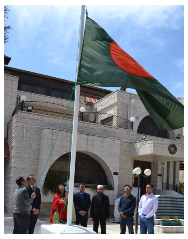
Ambass ador\ hoisting\ the\ National\ Flag\ at\ the\ Bangladesh\ Embassy\ in\ Amman\ on\ 26\ March\ 2020