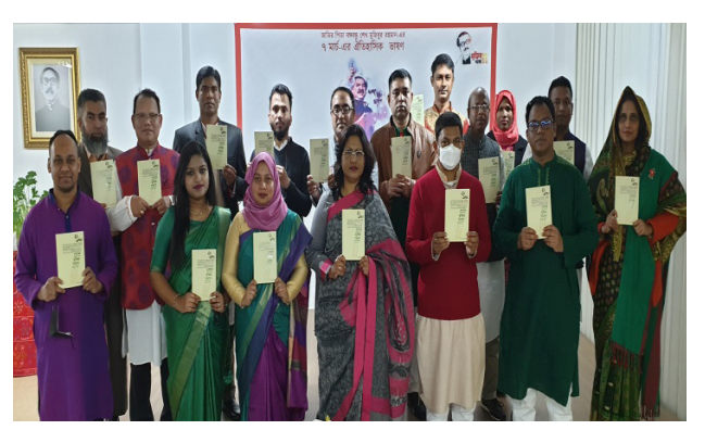
Bangladesh Embassy in Seoul unveiled a booklet containing the Historic 7 March speech of Bangabandhu in Korean language