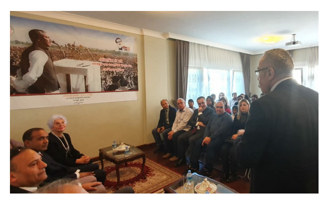
Bangladesh Consulate General in Istanbul organized a discussion on 7 March 2020

a discussion session. Later, the video of Bangabandhu's 7th March speech was screened. Expatriate Bangladeshis and officials of the Mission joined the programme along with their families. A photo gallery of the event organized by some of the Bangladesh Missions abroad is as follows: