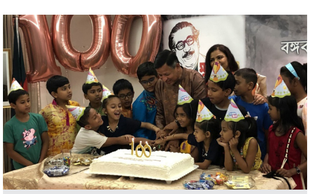
Bangladesh Embassy in Brasilia