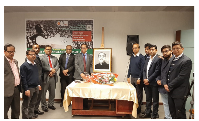
Flower wreathes were placed at the portrait of Bangabandhu in Bangladesh Embassy, Rome