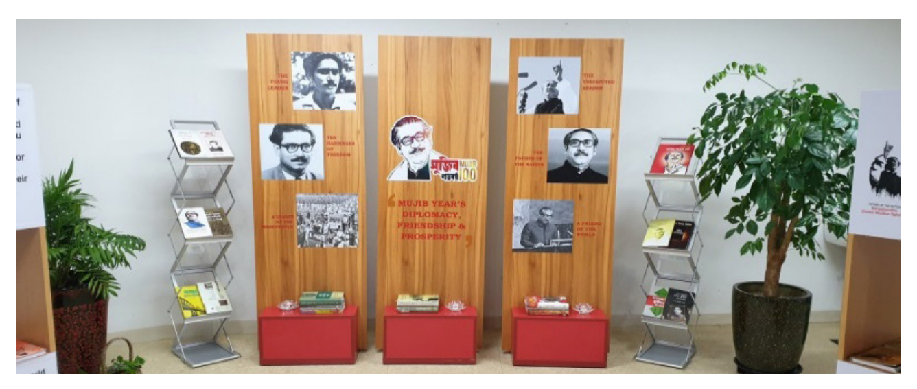
Bangladesh Embassy in Seoul