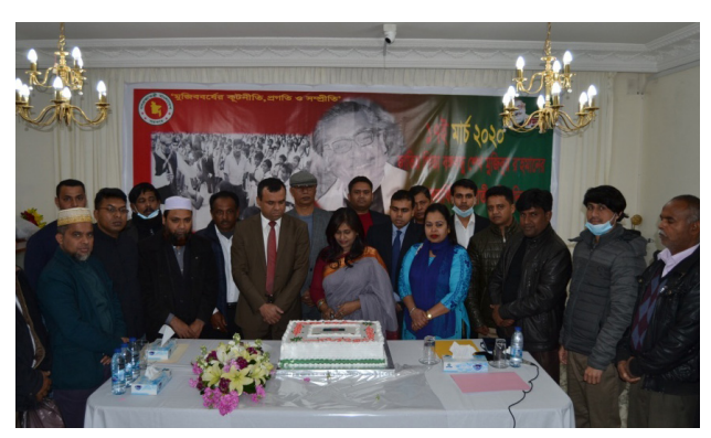
Bangladesh Embassy in Amman