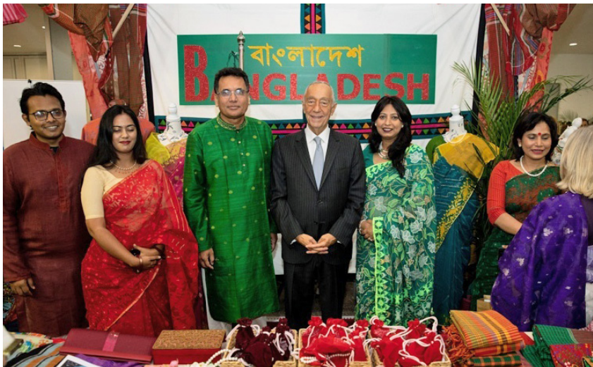
► Bangladesh pavilion in the ‘International Diplomatic Bazar-2019’ in Lisbon displays traditional clothing, pearls and other jewelry, ladies’ bags, muslin table-cloths and tapestry and other handicrafts

Bangladesh Embassy participated in the first ever Asian Food Festival in Lisbon showcasing the rich culinary tradition of Bangladesh. More than six hundred people of Portuguese and other nationality attended the Festival.