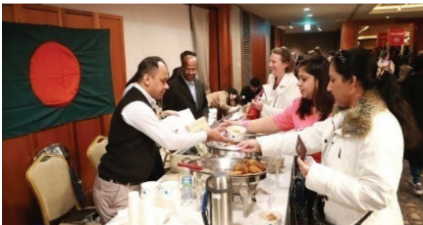
► Visitors are served with Bangladeshi potato patty, fish kebab, chicken biriyani and milk-tea at the Bangladesh stall

like the Hilsa, Shrimp, Cat Fish, Ruhi, Katla, Eel and Crabs were distributed among the visitors. Nearly 250 Korean and other foreign nationals have visited the Bangladesh pavilion during the EXPO and showed keen interest on our Crabs, Eel and Shrimp products. They were also eager to learn about the marketing formalities of fish products in Bangladesh.