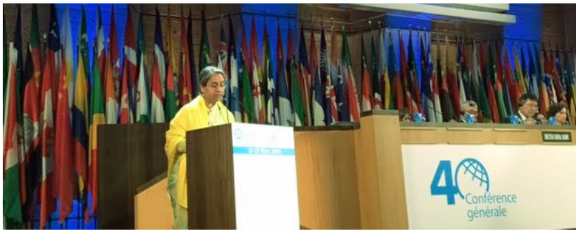
► Education Minister Dr. Dipu Moni, MP delivering the National Statement at the Plenary of the 40th UNESCO General Conference on 13 November 2019

Bangladesh participated in the 40th General Conference of UNESCO held in Paris during 12-27 November 2019 and was elected as a Vice-President. Education Minister Dr. Dipu Moni, MP led the 13-member Bangladesh delegation and delivered