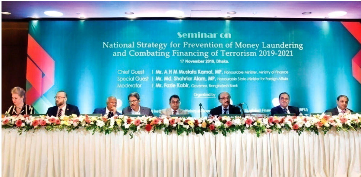
Guests of a seminar on 'National Strategy for Prevention of Money Laundering and Combating Financing of Terrorism 2019-2021' held on 17 November 2019 at a hotel in Dhaka

Ministry of Foreign Affairs along with Financial Institutions Division of the Ministry of Finance, Bangladesh Bank and Bangladesh Financial Intelligence Unit (BFIU) organized a seminar on 'National Strategy for Prevention of Money Laundering and Combating Financing of Terrorism 2019-2021' on 17 November 2019 at a hotel in Dhaka. Finance Minister was the Chief Guest of the event while State Minister for Foreign Affairs was present as the Special Guest. The Governor of Bangladesh Bank moderated the seminar. Among others, Senior Secretary of the Financial Institutions Division, Chairman of National