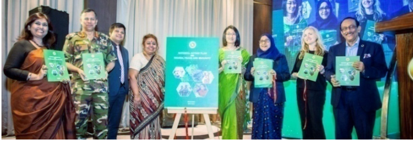
► National Action Plan on Women, Peace and Security (2019-2022) was launched on 24 November 2019 at a hotel in Dhaka

The first National Action Plan on Women, Peace and Security (2019-2022) was launched on 24 November 2019 at a hotel in Dhaka. Ministry of Foreign Affairs and UN Women jointly organized the launching ceremony. Foreign Secretary, Secretary