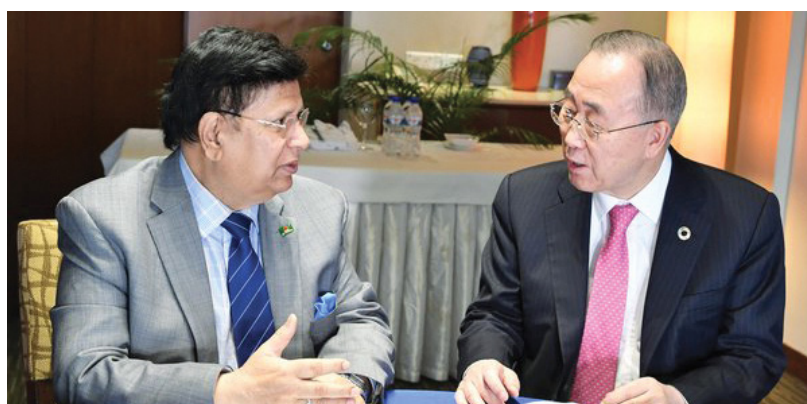
► Former Secretary General of the United Nations Ban Ki-moon met with Foreign Minister Dr. A K Abdul Momen, MP on a courtesy call at a local hotel in Dhaka on 23 November 2019

Former Secretary General of the United Nations Dr. Ban Ki-moon met with Foreign Minister Dr. A K Abdul Momen, MP on a courtesy call at a local hotel in Dhaka on 23 November