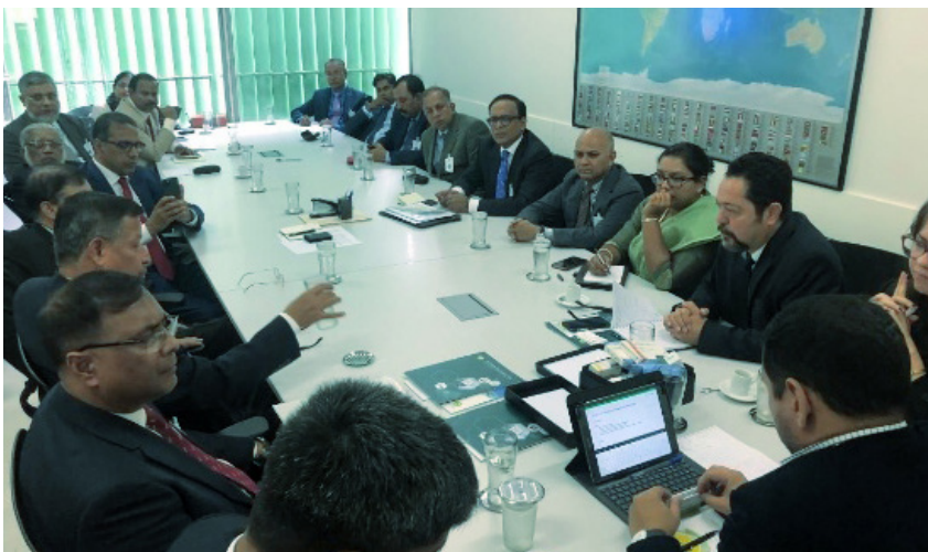
A Bangladesh delegation from the pharmaceutical sector met with the officials of the Brazilian Ministry of Health in Brasilia

The first-ever Bangladesh delegation from the pharmaceutical sector visited Brazil during 16-22 November 2019 to explore the possibilities of entering into the