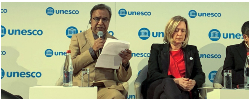
► State Minister for Cultural Affairs K M Khalid, MP participated in the 'Forum of Ministers of Culture' at the sideline of the 40th General Conference of UNESCO on 19 November 2019

with Audrey Azoulay, Director General of UNESCO. Following the General Conference, at the 208th Session of the Executive Board, Bangladesh was elected as one of the Vice-Chairs of the Executive Board of the UNESCO for the period 2019-2021.