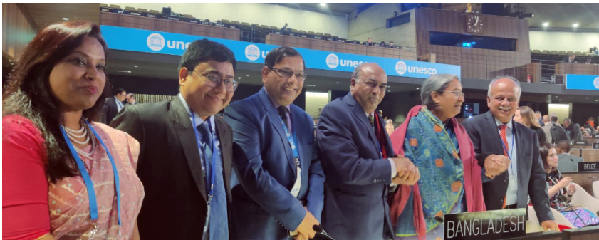
► Bangladesh delegation after the declaration of UNESCO's association with the Birth Centenary of Bangabandhu Sheikh Mujibur Rahman on 25 November 2019

UNESCO formally adopted Bangladesh's proposal on 25 November 2019 to celebrate the Birth Centenary of the Father of the Nation Bangabandhu Sheikh Mujibur Rahman in 2020. In February 2019, Bangladesh submitted the proposal to UNESCO which was co-sponsored by Cuba, India, Japan, Nepal and Poland. The Permanent