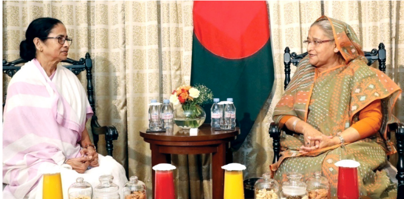
► Chief Minister of West Bengal Mamata Banerjee calls on Bangladesh Prime Minister Sheikh Hasina in Kolkata on 22 November 2019

Prime Minister Sheikh Hasina visited Kolkata, India on 22 November 2019 at the invitation of the Indian Prime Minister Narendra Modi and the President of BCCI (Board of Control