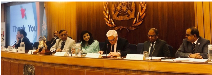
Bangladesh High Commission organized a seminar titled “Ship Recycling for Sustainable Development: Perspective from Bangladesh and the Region” in London on 21 November 2019

Bangladesh High Commission, London organized a seminar titled “Ship Recycling for Sustainable Development: Perspective from Bangladesh and the Region” at the sidelines of the International Maritime Organization’s (IMO) 30th extraordinary council session held at the IMO Headquarters in London on 21 November