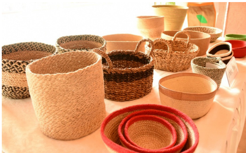
A wide array of finished jute items are put on the display at a local hotel in Islamabad on 30 November 2019

The idea of the event was to celebrate jute, the golden fibre of Bangladesh, which had come back into spotlight in recent years for being a natural substance, due to environmental concerns over artificial products like synthetic fibres and plastics.