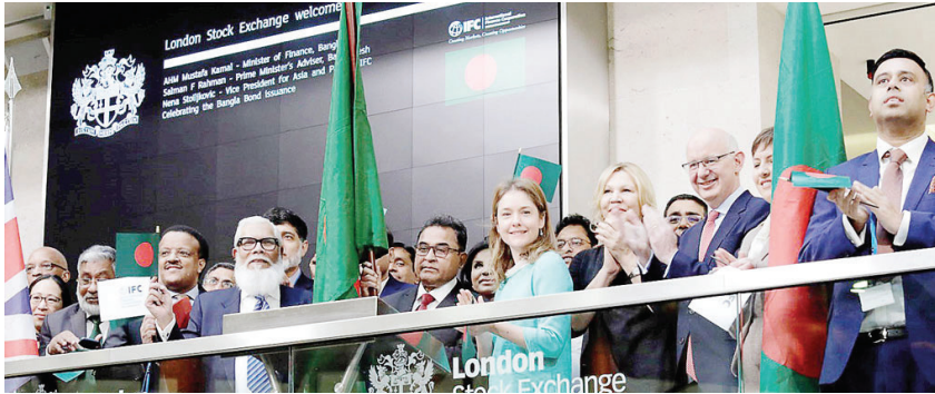
'To Ring The Bell' ceremony of listing of 'Bangla Bond' in the London Stock Exchange on 11 November 2019

The International Finance Corporation (IFC), a sister concern of the World Bank, floated the first-ever Bangladeshi Taka - “Bangla Bond” in the London Stock Exchange (LSE). ‘To Ring The Bell’ ceremony of listing of the bond was held on 11 November 2019 followed by an ‘Investor’s Roundtable’