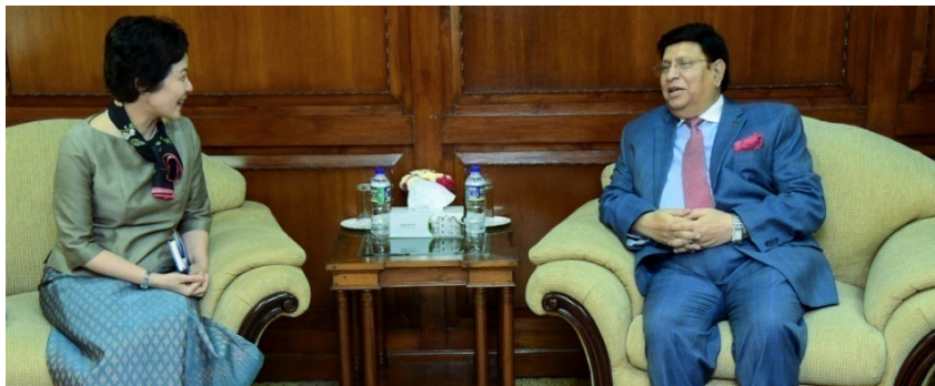
The newly appointed Ambassador of Thailand to Bangladesh Arunrung Phothong Humphreys called on Foreign Minister Dr. A K Abdul Momen, MP at the Ministry of Foreign Affairs on 5 November 2019

2019. Foreign Minister congratulated the Ambassador on her appointment in Dhaka and assured all out support in discharge of her responsibilities.