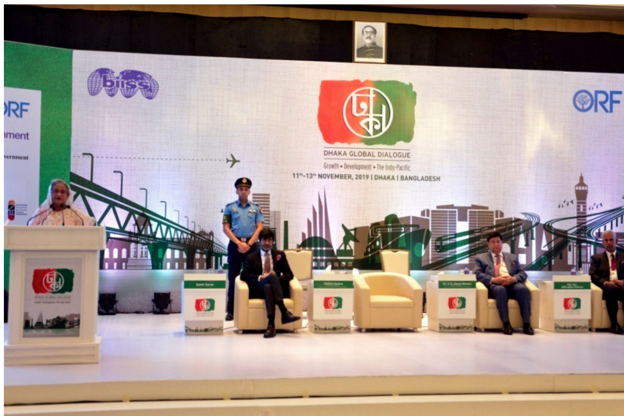
Prime Minister Sheikh Hasina is delivering speech in the inaugural session of the Dhaka Global Dialogue 2019 at a local hotel in Dhaka on 11 November 2019

The first ever Dhaka Global Dialogue was held on 11-13 November 2019 in Dhaka, organized by the Bangladesh Institute of International and Strategic Studies (BISS) and the Observer Research Foundation (ORF), India. The Foreign Service Academy acted as the focal point on behalf of the Ministry of Foreign Affairs. On 11 November 2019 Prime Minister Sheikh Hasina inaugurated the event.