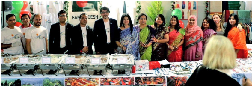
Bangladesh stall at the 'Christmas Bazar' in Athens displays posters, traditional handicraft items and Bangladeshi cuisines

Bangladesh Embassy in Athens put up a stall at the 'Christmas Bazar' on 23-24 November 2019 in Athens to showcase the rich culture, tradition and development activities of Bangladesh. An organization named 'Friends of Children' organized the 'Christmas Bazar' to support the Children of Athens. 37 countries along with a large number of local organizations participated