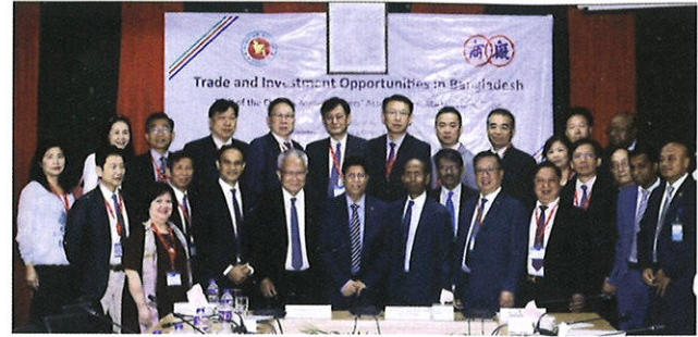
CMA delegation is seen with Foreign Minister Dr. A K Abdul Momen, MP at UNCLOS conference room in the Ministry of Foreign Affairs

Foreign Minister welcomed them and wished them a fruitful visit in Bangladesh. In his introductory remarks Foreign Minister highlighted the pro-business, trade and investment friendly climate of Bangladesh. He reiterated, Bangladesh is now recognised worldwide as 'Development Miracle' under the visionary leadership and bold measures and initiatives taken by Prime Minister Sheikh Hasina and her government; this program is the true reflection of her vision and the commitment of the whole of the government approach to advocate and emphasize economic and trade diplomacy. He also highlighted different investment and trade entitlement and facilities provided by the government to the foreign investors like low cost of gas, electricity, water, Economic Zones, demographic dividend, etc. He added, recent stable economic growth and the strong growth projections in the coming decade by a number of world's reputed organizations has turned Bangladesh as one of the attractive destinations for investment in the present time. He assured the fact, under the leadership of Prime Minister Sheikh Hasina, Bangladesh is politically most stable country in the region and her government shows 'zero tolerance' policy to any disruptive activities in the country that can affect business