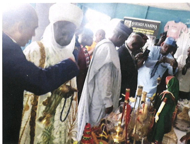
Bangladesh Pavilion in the Niger National Trade Fair-2019 attracts huge crowd

In line with the Bangladesh Government's thrust on 'economic diplomacy', Bangladesh Mission put up a large stall with its own collection of exportables. Pharmaceuticals, ceramics, jute and leather products, RMG and knitwear, tea, jute leaf tea, electrical appliances, light engineering, plastic and melamine products, spice and curry powder, pickle, food items, snacks, pearl items, sari (maslin, silk), nakshikantha, handicrafts, among others, were on display which drew huge crowd each day. Representative of the Governor, Niger Chamber Officials and business leaders also visited the stall and admired the quality of Bangladeshi products. Publications on export and investment and tourism potentials, among others, were also on display. Roll-up-Banners containing pictorial description of the impressive achievements of Bangladesh at home and abroad were put around the pavilion. Documentaries on the development journey of Bangladesh were screened simultaneously which was an added attraction.