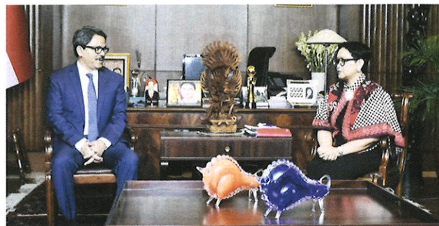
State Minister for Foreign Affairs Md. Shahriar Alam, MP meets with Foreign Minister of Indonesia Rento Marsudi in Jakarta

The Rohingya issue also figured prominently in the discussion where they agreed enhanced role of the ASEAN in the repatriation of the forcibly displaced Rohingyas sheltered in Bangladesh.