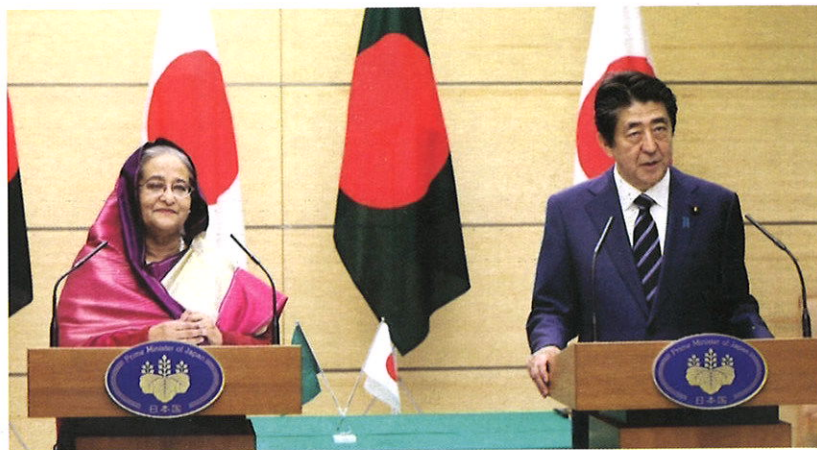
Prime Minister Sheikh Hasina and Japanese Prime Minister Shinzo Abe at a joint press briefing in Tokyo

Prime Minister Sheikh Hasina paid an official visit to Japan on 28-31 May 2019. During the visit, she attended the Japan-Bangladesh Summit Meeting with Japanese Prime Minister Shinzo Abe on 29 May, and the two Prime Ministers witnessed the signing of the 40th ODA loan package involving US$ 2.5 billion. Taro Aso, Deputy Prime Minister and Minister of Finance and Taro Kono, Minister for Foreign Affairs attended the meeting from Japanese side, Finance Minister A H M Mustafa Kamal and others from Bangladesh side also attended the meeting. Japanese Prime Minister congratulated Sheikh Hasina on her reappointment as Prime Minister and welcomed her visit to Japan. He stated that Japan highly appreciated the efforts being made by the Government of Bangladesh,