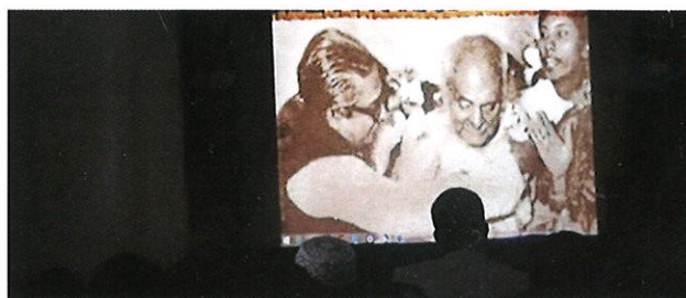
A documentary on the life of National Poet Kazi Nazrul Islam was screened in Male'

The Embassy also celebrated the 120th Birthday of the National Poet Kazi Nazrul Islam with due respect on 26 May 2019 at the Embassy conference hall.