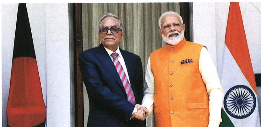
President Md. Abdul Hamid calls on Indian Prime Minister Narendra Modi in New Delhi

President of Bangladesh Md. Abdul Hamid visited New Delhi, India from 29 to 31 May 2019 to attend the Swearing-in Ceremony of the Indian Prime Minister Narendra Modi for the second term after the landslide victory in the 17th Lok Sabha Elections. President, accompanied by his spouse Mrs. Rashida Khanam, Minister for Liberation War Affairs A K M Mozammel