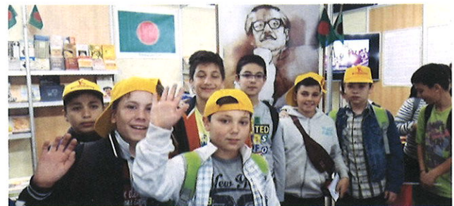
School children gather at the Bangladesh stall in the Thessaloniki Book Fair

On the opening day of the Fair, Bangladesh Ambassador in Greece made a presentation on "The Unfinished Memoirs", the autobiography of Bangabandhu Sheikh Mujibur Rahman, before the readers and critics in the Cosmos Hall of the Fair venue. He highlighted the struggle and glorious work and life of Bangabandhu Sheikh Mujibur Rahman and his unmatched contribution to Bengali nation in their struggle for self-determination and ultimate independence. The audience, most of them not familiar with our history and heritage, expressed keen interest to get Greek translation of the book.