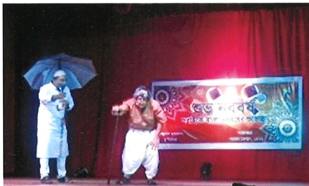
Bangladesh Embassy, Brasilia