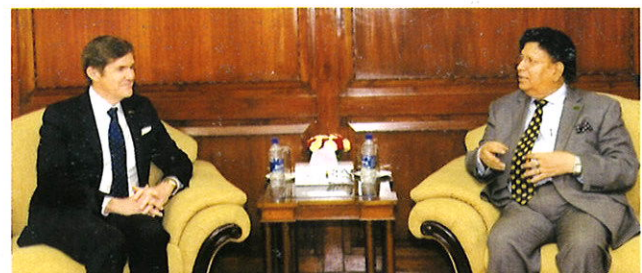
US Ambassador Earl Robert Miller calls on Foreign Minister Dr. A K Abdul Momen, MP at his office

Foreign Minister said, Bangladesh welcomes forward looking connectivity and infrastructure projects in the region. He also noted that maritime sector of the region could be harnessed to improved business connectivity and shared prosperity of the people. The upcoming meeting