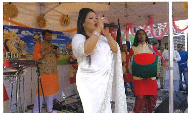
Bangladesh Embassy, The Hague