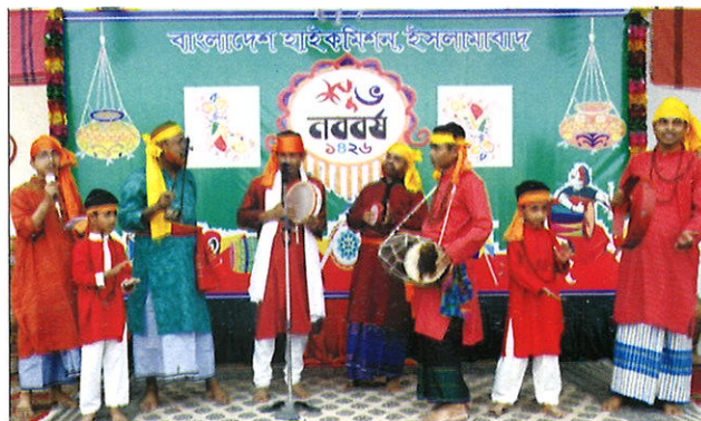
Bangladesh High Commission, Islamabad