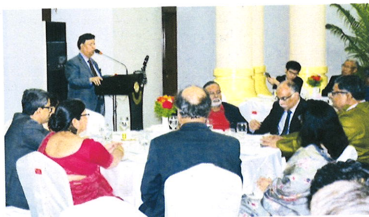
Foreign Minister Dr. A K Abdul Momen, MP delivers welcome speech at the dinner at State Guest House Jamuna for the foreign dignitaries under 'Visit Bangladesh' Programme

Foreign Minister Dr. A K Abdul Momen, MP hosted a dinner on 18 April 2019 at the State Guest House Jamuna in honour of the foreign dignitaries who participated in the Visit Bangladesh Programme held from 13 to 18 April 2019. 48 prominent writers, retired diplomats, retired civil servants, media personnel and members of intelligentsia from 26 countries around the world visited Bangladesh under the programme.