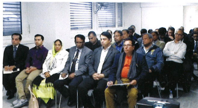
Participants at a seminar on 'Sending remittance by legal channel' held in Geneva

To sensitize expatriates and to increase remittance through legal channels, the Permanent Mission of Bangladesh organised a Seminar on 27 April 2019 in the Mission. Expatriates including those involved in remittance businesses, agents of the remittance houses, previously awarded CIP and victims of hundi, among others, attended the Seminar. The attendees engaged in deeper discussions and offered constructive suggestions.