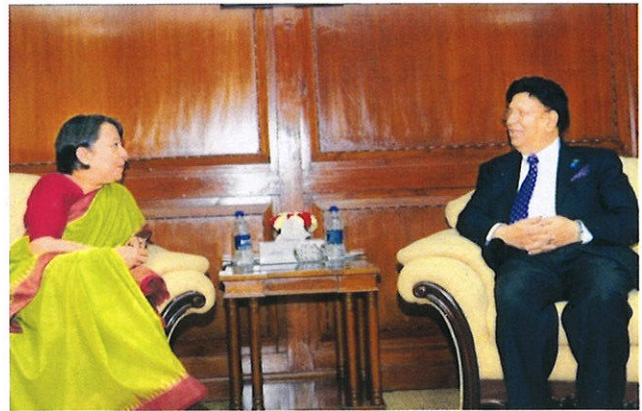
Indian High Commissioner Riva Ganguly Das calls on Foreign Minister Dr. A K Abdul Momen, MP at his office

Newly appointed Indian High Commissioner to Bangladesh Riva Ganguly Das called on Foreign Minister Dr. A K Abdul Momen, MP at his office on 3 April 2019. Foreign Minister welcomed her to Bangladesh wishing her success assuring all out cooperation from the government of Bangladesh during her tenure. They discussed issues related to bilateral relations. Foreign Minister termed the relation between Bangladesh and India as 'Historic' which has grown mature in course of time relying upon mutual trust. He mentioned that various important issues like land boundary, maritime boundary, etc. have been solved through effective dialogue between the two countries which can be followed as 'model' in the world. High Commissioner handed over a letter from Indian External Affairs Minister Sushma Swaraj in which she mentioned that the present bilateral relations between Bangladesh and India was passing a 'Golden Chapter' in true sense.