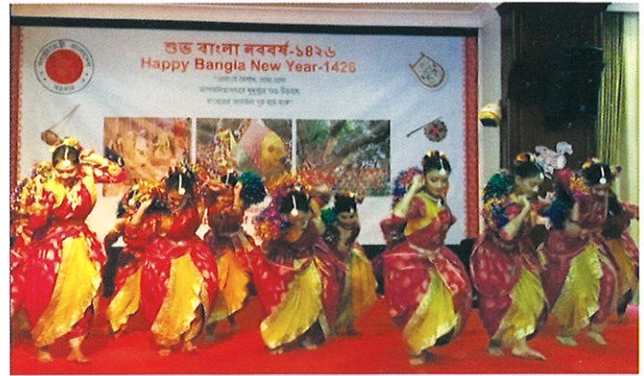
Bangladesh Embassy, Ankara