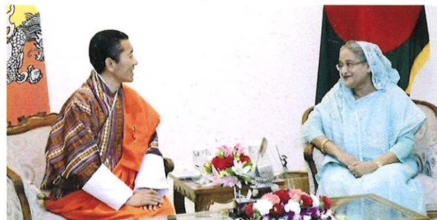
Prime Minister of Bhutan Lyonchhen Dr. Lotay Tshering calls on Prime Minister Sheikh Hasina at her office

The official talks between Bangladesh and Bhutan, led by the two Prime Ministers, were held on 13 April 2019 in an atmosphere of great warmth and cordiality reflecting the excellent bilateral relations and age-old friendship