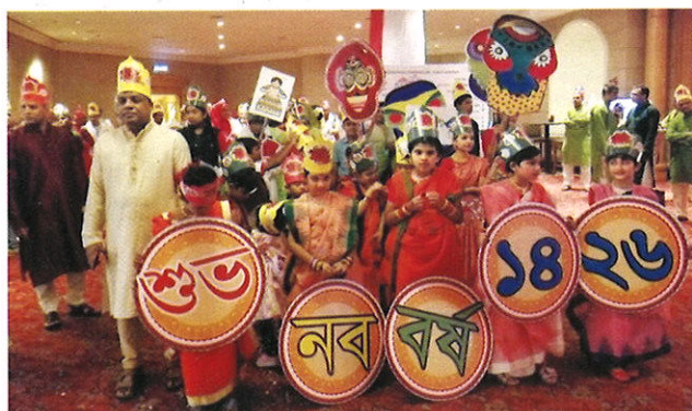
Bangladesh High Commission, Kuala Lumpur