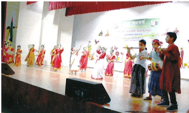
Bangladesh Embassy, Abu Dhabi