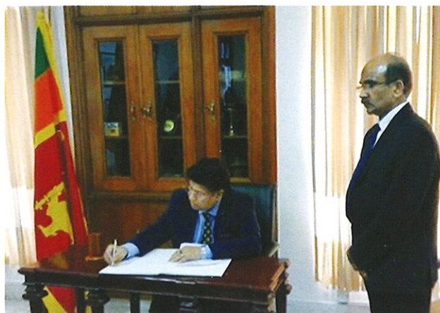
Foreign Minister Dr. A K Abdul Momen, MP signs the condolence book opened at the High Commission of Sri Lanka in Dhaka

Foreign Minister Dr. A K Abdul Momen, MP also signed the condolence book opened at the High Commission of Sri Lanka in Dhaka. He expressed deepest condolences at the loss of so many lives. The Foreign Minister also expressed the offer of the Government of Bangladesh to provide all out support and cooperation to the Sri Lankan Government during this critical and challenging time.