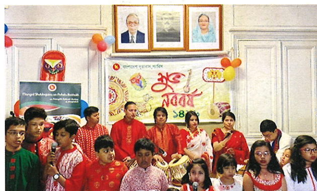
Bangladesh Embassy, Paris