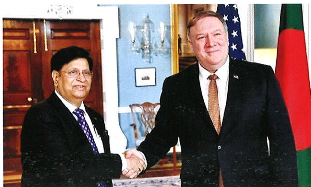
Foreign Minister Dr. A K Abdul Momen, MP meets with US Secretary of State Mike Pompeo at the US State Department

Foreign Minister Dr. A K Abdul Momen, MP met with US Secretary of State Mike Pompeo on 08 April 2019 at the US State Department. This is the first meeting between the two leaders since their assumption of office in respective governments. Issues featuring in the meeting were: repatriation of the Rohingyas and creation of adequate