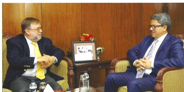
Non-resident Argentine Ambassador Daniel Chuburu calls on State Minister for Foreign Affairs Md. Shahriar Alam, PM at his office

State Minister for Foreign Affairs Md. Shahriar Alam, MP expressed keen interest to sign Free Trade Agreement (FTA) with South American trade bloc MERCOSUR at an early date to tap the under-exploited South American market. Bangladesh has already submitted "Letter of Intent" to that effect to secure greater access for Bangladeshi products to a huge market of 300 million consumers across Argentina, Brazil, Paraguay and Uruguay. State Minister conveyed this interest when new non-resident Argentine Ambassador Daniel Chuburu (based in New Delhi) called on him earlier on 11 April 2019. Argentine Ambassador, whose country is the current President of this trade bloc, promised full cooperation in this regard.