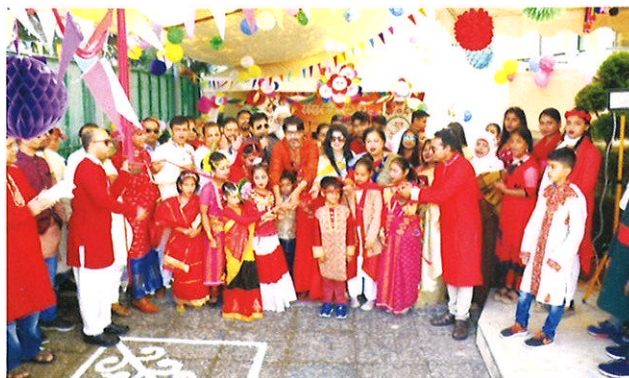
Bangladesh Embassy, Athens