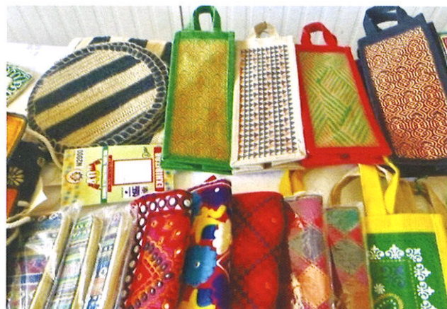
Handicrafts displayed at Bangladesh Stall in Kaduna International Trade Fair 2019 in Kaduna, Nigeria

Pharmaceuticals, ceramics, jute and leather products, RMG & knitwear, tea, jute leaf tea, electrical appliances, light engineering, plastic & melamine products, spice & curry powder, pickle, food items, snacks, pearl items, sari (maslin, silk), nakshikantha and handicrafts, among others, were on display which drew huge crowd each day. Deputy Governor of Kaduna along with Chamber President and other dignitaries visited the stall and admired the quality of Bangladeshi products. Publications on export and