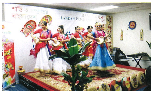
Bangladesh Consulate General, New York