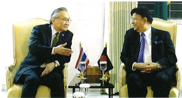
Thai Foreign Minister Don Pramudwinai meets with Bangladesh Foreign Minister Dr. A K Abdul Momen, MP in Dhaka

Don Pramudwinai, Minister of Foreign Affairs of Thailand, in the capacity of the Chair of ASEAN, paid an official visit to Bangladesh on 3-4 April 2019 with a view to supporting efforts to address the issue of displaced persons from Rakhine State in Bangladesh. During the visit, the Thai