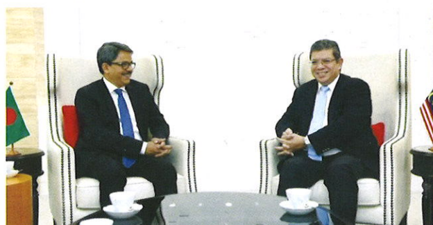
State Minister for Foreign Affairs Md. Shahriar Alam, MP calls on Malaysian Foreign Minister Dato Saifuddin Abdullah in Kuala Lumpur

State Minister for Foreign Affairs Md. Shahriar Alam, MP led a four-member delegation to Kuala Lumpur to garner Malaysian support in an initiative called South and South East Asian Cooperation (SEACO). It is a private sector and track-II level Forum of five OIC countries in the region- Bangladesh, Brunei, Indonesia, Malaysia and Maldives with an objective of advancing regional economic integration. The Forum in the emergence is going to function in the model of World Islamic Economic Forum (WIEF) exclusively with the agenda of economic cooperation among the member countries and their neighborhoods. Bangladesh has taken the initiative and ready to host SEACO's launching conference in Dhaka towards the end of June 2019 with expected participation of the Foreign Ministers along with the public and private stakeholders.