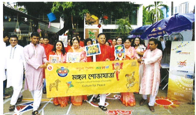
Bangladesh Embassy, Bangkok