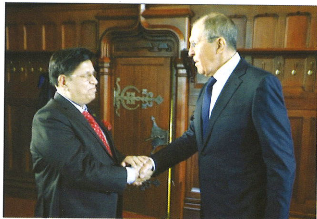
Foreign Minister Dr. A K Abdul Momen, MP meets his Russian counterpart Sergey Lavrov in Moscow

During the talk, Bangladesh Foreign Minister reiterated the strong admiration of the people of Bangladesh for the Russian Federation due to the valued support and contribution received from the people of the then Soviet Union during the Liberation War in 1971 and for the rehabilitation and reconstruction efforts after the independence. Both the Foreign Ministers expressed deep satisfaction over the current progress of bilateral engagements between the two friendly countries.