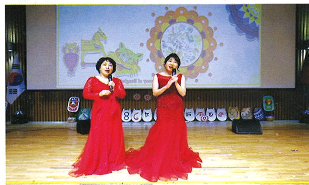
Bangladesh Embassy, Seoul