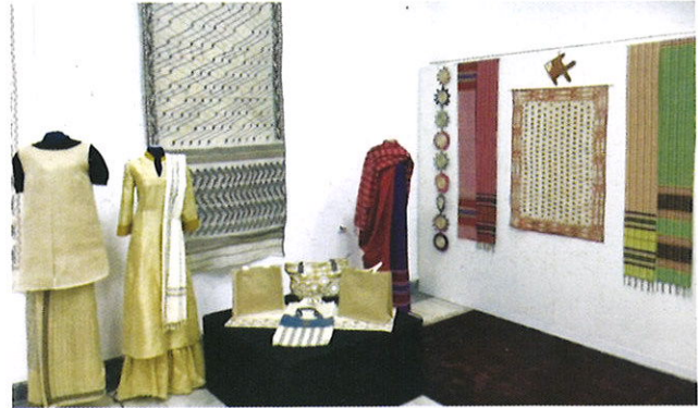
Bangladeshi jute products are displayed at Art and Applied Arts Exhibition in Tashkent

Bangladesh corner at the Exhibition Hall was one of the most attended corners and lot of visitors, including foreign nationalities, artists and local art loving people. Representatives of the Embassy gave out information to visitors.