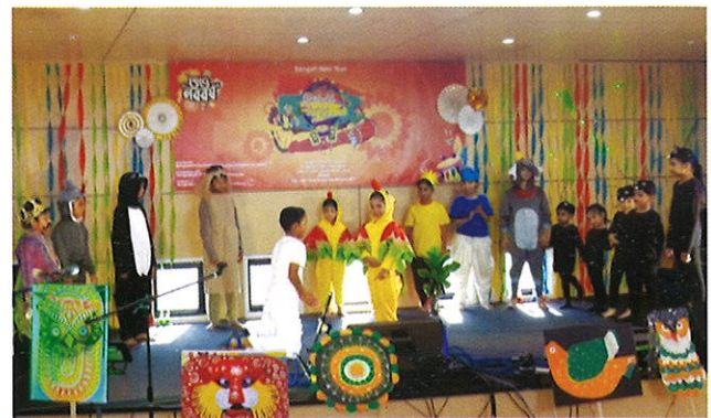
Bangladesh High Commission, Canberra