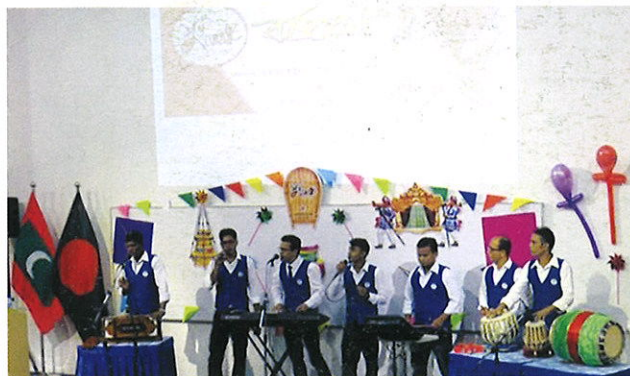
Bangladesh Embassy, Male'