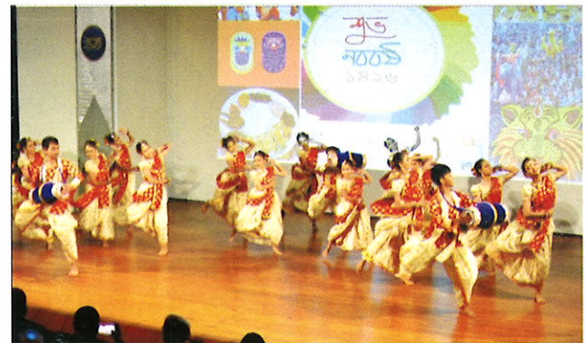
Bangladesh Consulate General, Istanbul