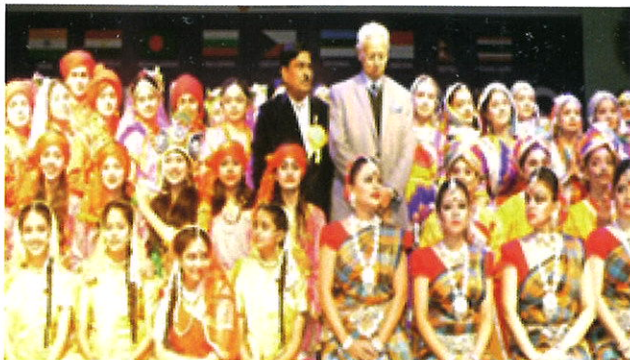
Bangladesh High Commissioner is seen with the participants