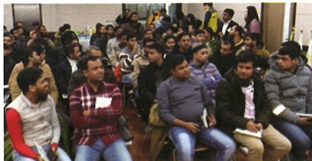
Participants at a seminar held in Incheon City, Korea

Embassy of Bangladesh in Seoul along with the HRD Korea and the Incheon Support Center for Foreign Workers organized a Seminar on the "Do's and Don'ts while staying in Korea" on 27 January 2019. 'Happy Return Program' focusing on the workers' pre-departure plans for Bangladesh including a presentation on the 'Entrepreneurship' encouraged the workers to have self-confidence including a vision for future supported by a realistic plan.