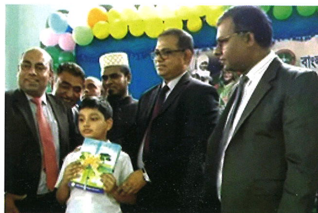
Text book distribution ceremony in Jeddah

Bangladesh Consul General in Jeddah inaugurated the Book Festival 'Textbook Day 2019' on 01 January 2019 and distributed new books among the students of Bangladesh International School (National Curriculum) conforming to the festival in Bangladesh. Other officials of the Consulate General and community leaders were present in the Book Festival.