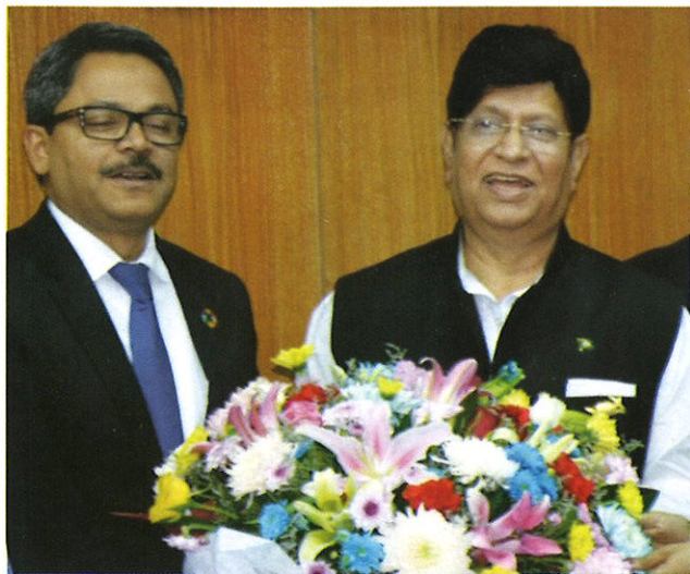
Foreign Minister Dr. A K Abdul Momen, MP and State Minister Md. Shahriar Alam, MP were welcomed with flower bouquet

Foreign Ministry officials welcomed Foreign Minister Dr. A K Abdul Momen, MP on 8 January 2019, his very first day in the Ministry. All the senior officials of the Ministry extended warm reception to the newly elected Foreign Minister and also to the State Minister for Foreign Affairs Md. Shahriar Alam, MP for assumption office on the second term.