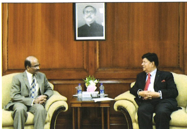
Sri Lankan High Commissioner Gen. A W J C De Silva calls on Foreign Minister Dr. A K Abdul Momen, MP at his office