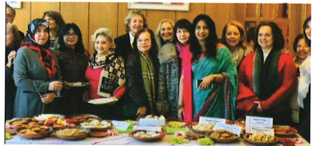
Display of traditional pithas at Lisbon

Bangladesh High Commission in Islamabad organized a day-long 'Pitha Utsab' on 13 January, 2019 at its Chancery premises. High Commissioner of Bangladesh to Pakistan Tarik Ahsan inaugurated the festival. The event became quite colourful with the array of pithas artistically displayed in the sprawling green lawn of the Chancery in a sunny winter morning. The visitors which included members of the High Commission, Bangladesh expatriates and their family members were in a festive mood as they relished various kinds of pitha.