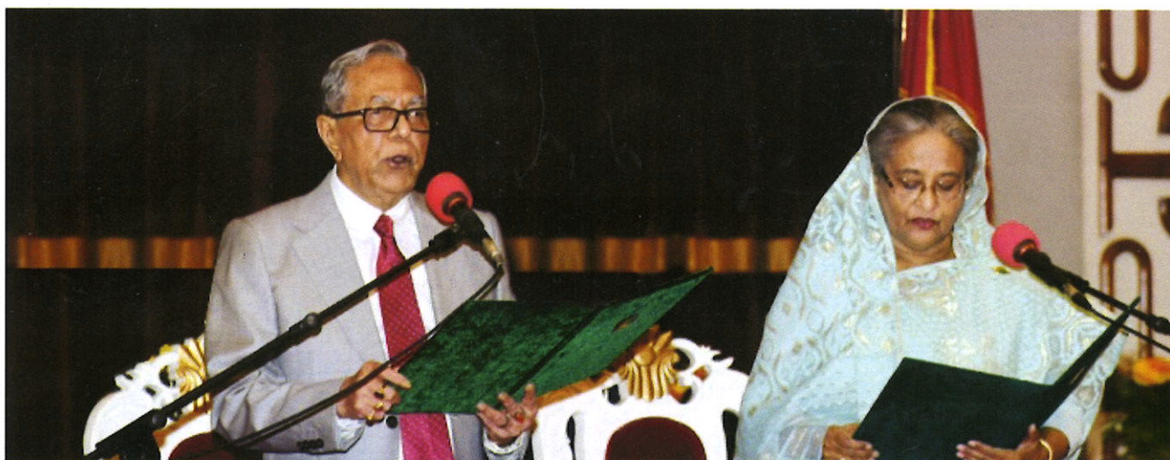
Prime Minister's oath taking Ceremony