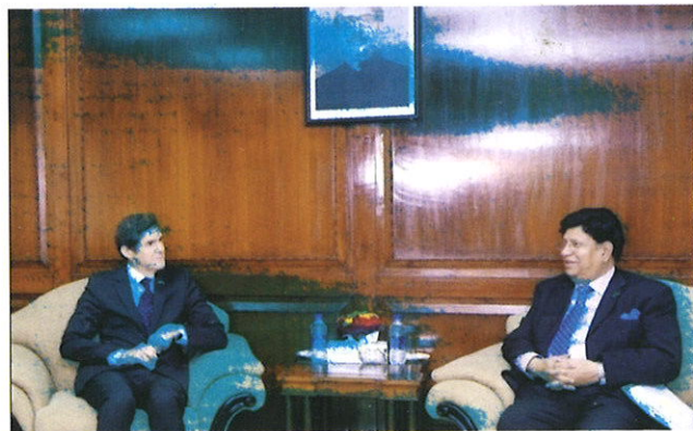
US Ambassador Earl Robert Miller calls on Foreign Minister Dr. A K Abdul Momen, MP at his office

US Ambassador to Bangladesh Earl Robert Miller called on Foreign Minister Dr. A K Abdul Momen, MP on 31 January 2019. He congratulated the newly appointed Foreign Minister of Bangladesh and assured him full cooperation in his new assignment. Foreign Minister thanked US Ambassador and said that there is the scope to take existing friendly relations between Bangladesh and USA to a new height. US Ambassador was highly appreciative of the Government of Prime Minister Sheikh Hasina for giving shelter to the persecuted Rohingyas. Foreign Minister raised the issue of creating "safe zone" inside Rakhine State for the Rohingyas and informed the US envoy that around one lac Rohingyas are planned to be relocated in Bhashan Char on voluntary basis. He also sought support from the US administration to secure tariff free access for Bangladesh's garments products in the US market.