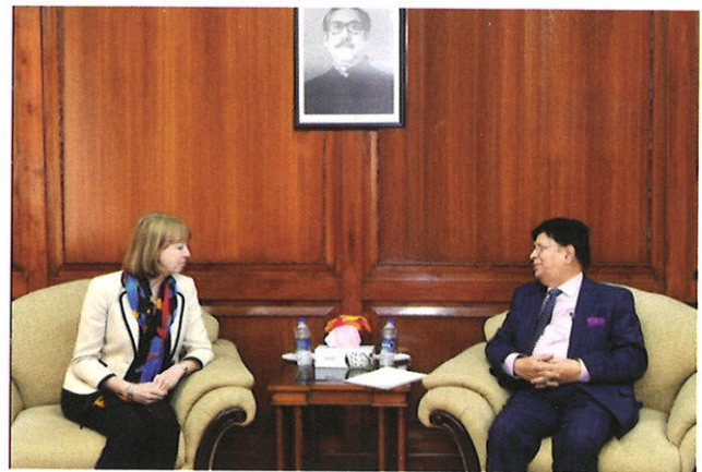
British High Commissioner Allison Blake calls on Foreign Minister Dr. A K Abdul Momen, MP at his office

acknowledged tremendous contribution of China in Bangladesh's economic development. Foreign Minister expressed gratitude to China for signing 27 Agreements and MOU, worth billions of dollar investment, during Xi Jinping's visit to Bangladesh in 2016 when bilateral relationship was elevated to strategic partnership.