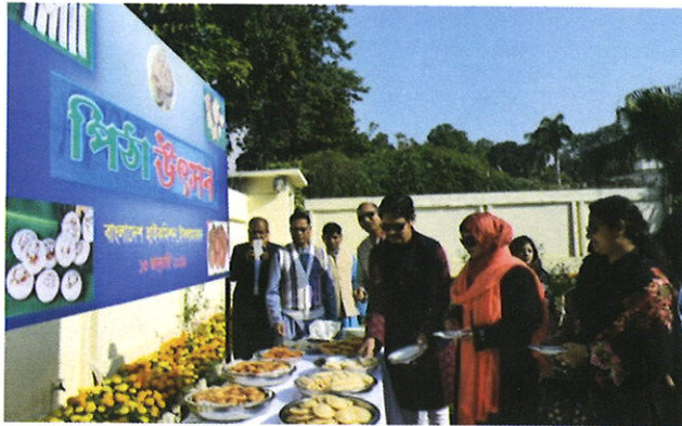
Display of traditional pithas at Islamabad

Bangladesh Embassy in Lisbon organized "Bangladesh Pitha Utsab 2019" to showcase the rich culinary tradition of Bangladesh at the Bangladesh House in Lisbon on 30 January 2019. Over 50 guests, mostly women including members of Association of the Portuguese Diplomatic Family (AFDP), members of the Portuguese civil society, spouses of the Ambassadors and other diplomats attended the festival.