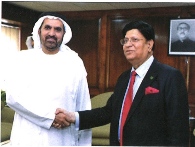
UAE Ambassador Saed Mohammed Saed Hmaid Almheiri calls on Foreign Minister Dr. A K Abdul Momen at his office

socio-economic development of the two peoples. They also exchanged views on regional and international issues of mutual concern as well as on cooperation in different multilateral platforms.