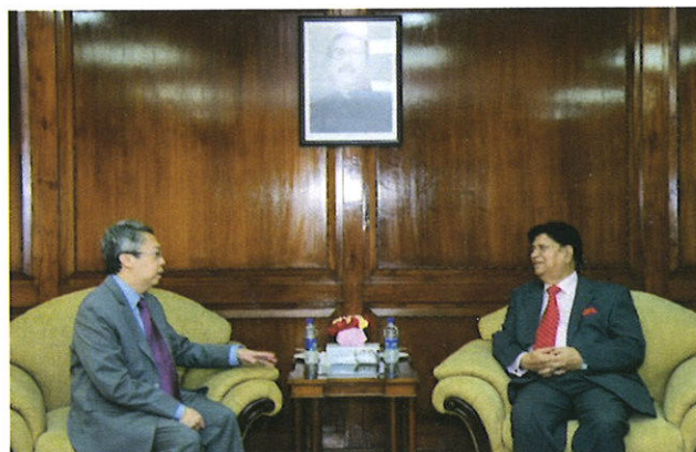
Consul of Singapore William Chik calls on Foreign Minister Dr. A K Abdul Momen, MP at his office

Consul of Singapore in Bangladesh William Chik congratulated Foreign Minister Dr. A K Abdul Momen, MP when he met him on 20 January 2019 and reaffirmed that the government of Singapore stands ready to further strengthen relationship with the new government of Bangladesh under the leadership of Prime Minister Sheikh Hasina. Foreign Minister praised Singapore and its dynamic people for the tremendous economic success and requested the Consul to take initiatives for reducing existing large bilateral trade deficits. The Consul of Singapore assured to convey this message to his government for appropriate actions in this regard. Foreign Minister emphasized boosting volume of skilled manpower export to Singapore from Bangladesh.