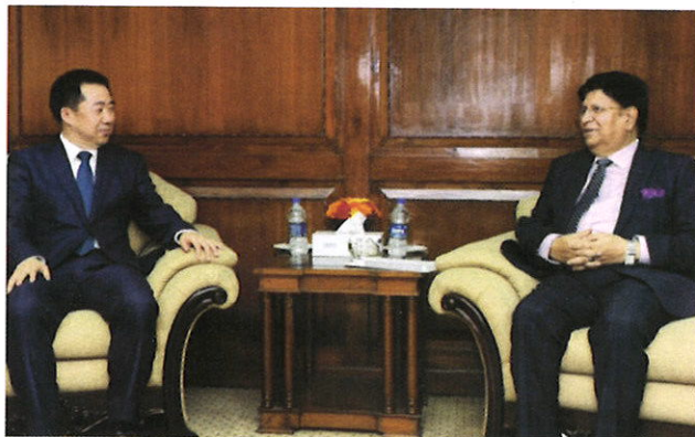
Chinese Ambassador Zhang Zuo calls on Foreign Minister Dr. A K Abdul Momen, MP at his office

socio-economic development of the two peoples. They also exchanged views on regional and international issues of mutual concern as well as on cooperation in different multilateral platforms.