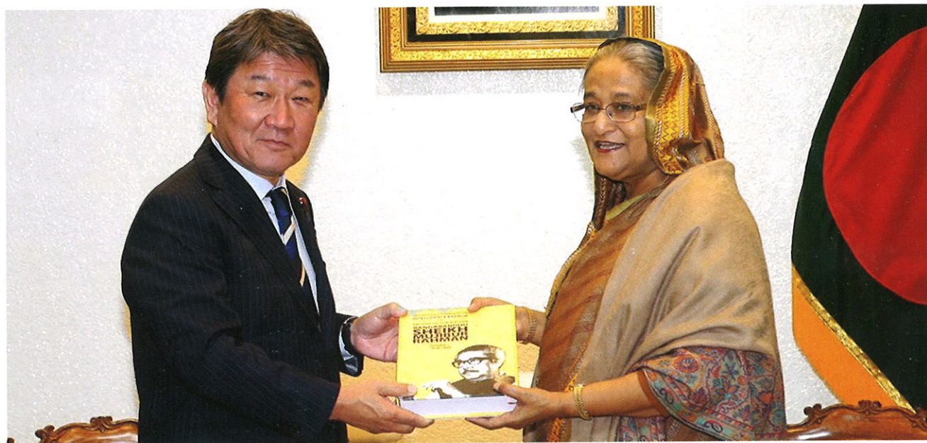
Japanese Minister in charge of Economic Revitalization Toshimitsu Motegi calls on Prime Minister Sheikh Hasina at her office

Japanese Minister in charge of Economic Revitalization Toshimitsu Motegi congratulated Prime Minister Sheikh Hasina on the inauguration of her fourth term as Prime Minister and assured Japan's support in Bangladesh's development efforts during his call on the Prime Minister at her office on 15 January 2019. He also said that Japan is appreciative of Bangladesh's inclusive national election since it was conducted with participation of all major opposition parties. He stated that Japan intends to support Bangladesh's future efforts in development and prosperity so that Bangladesh can achieve the status of a middle income country by 2021. He shared his experience with Prime Minister on his visit to Bangabandhu Memorial Museum saying he was overwhelmed by seeing different memories and documents on the life of the Father of the Nation. He said that Japanese companies are showing strong interest to open business in Bangladesh being attracted by steady economic development of the country under the leadership of Prime Minister Sheikh Hasina.