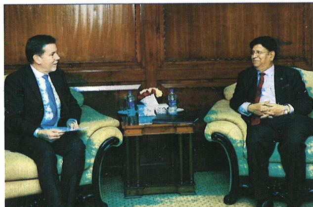
UNHCR Country Representative Steven Corliss calls on Foreign Minister Dr. A K Abdul Momen at his office

Newly appointed Country Representative of the United Nations High Commissioner for Refugees (UNHCR) in Bangladesh Steven Corliss presented